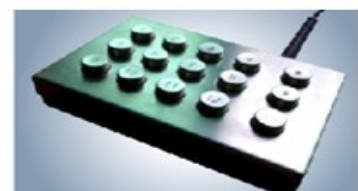
Metal Keypad MK15E