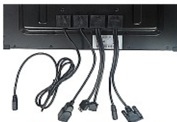
Sealed Cable Design