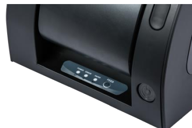
High Speed Thermal Printer, 80/58mm, 200mm/sec