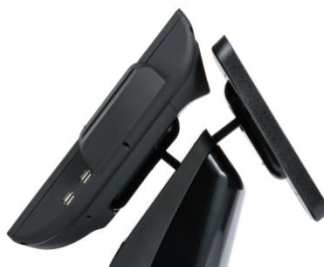
9.7/12.1inch Dual Display