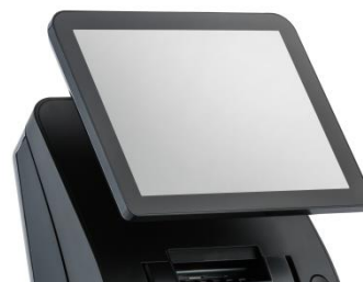
12inch / 15.1inch Operator Display