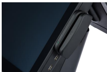
Magnetic Card Reader, 3 Tracks