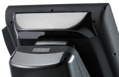
LCD or VFD Customer Display 2 lines * 20 Characters