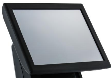
Frame Front Bezel Resistive Touchscreen