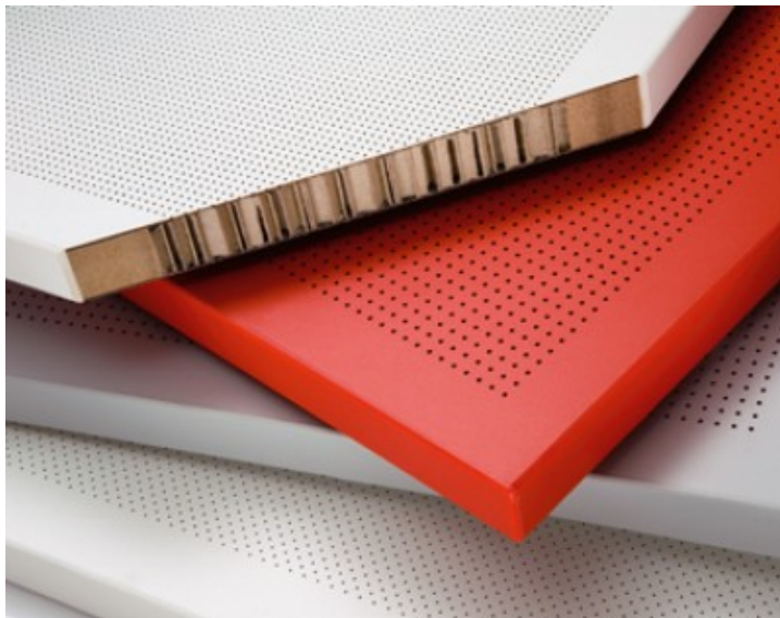
Caption: - Sound absorption of the "light" kind

Two years after having been launched in 2005, Acoustic-Lightboard® and other materials by Richter akustik & design received the award "Best of the Best" on the interzum Cologne.