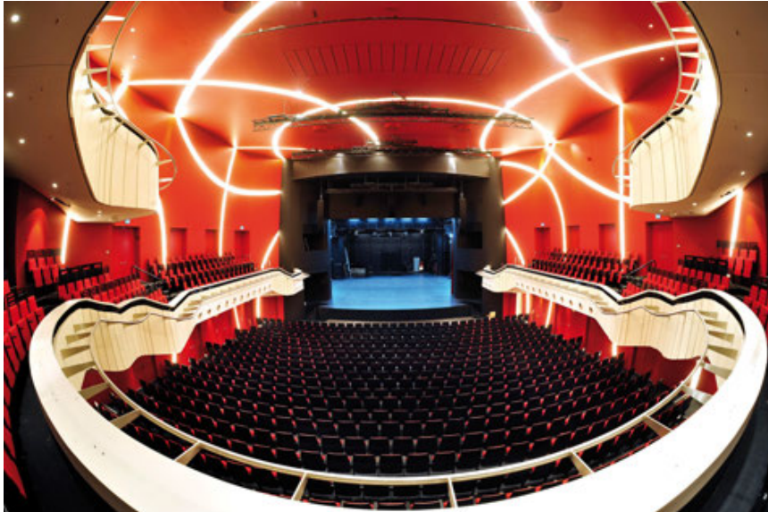
Deutsches Theater München