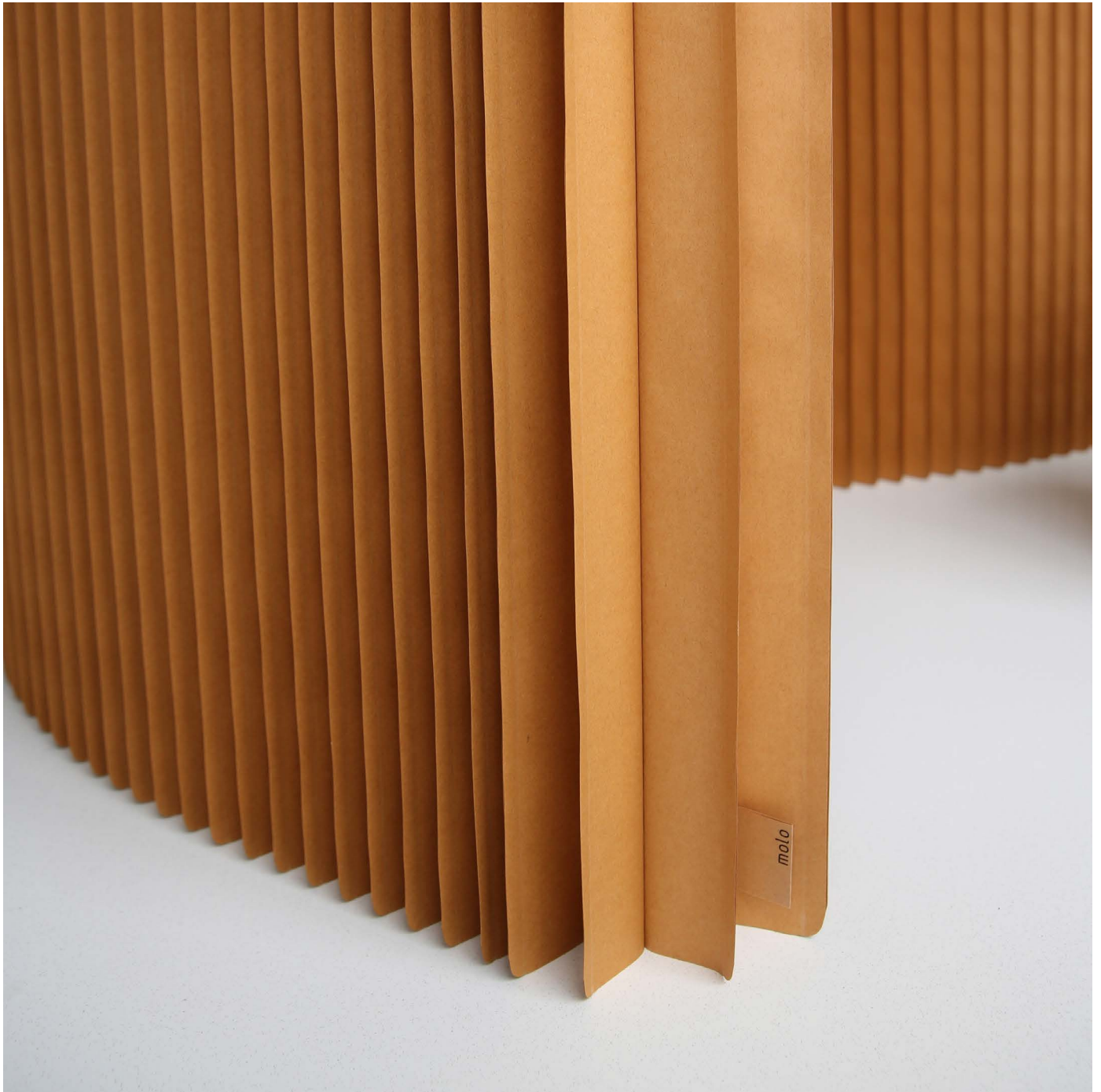
The tailored effect of softwall's new narrower profile and radial edge makes for handsome partitions that are a pleasure to handle.