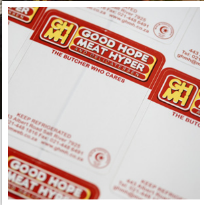
Customised Food Labels